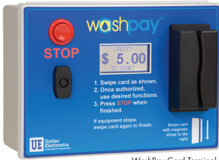
WashPay Card Terminal