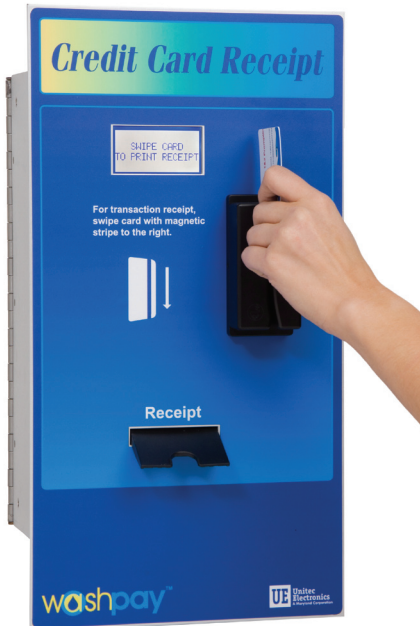
WashPay Receipt Printer

The WashPay Site Management System consists of card terminals, a central site controller and a networking kit. Optional components include a customer receipt printer, credit modem (not required for Internet credit card processing) and a User Interface Kit for the site controller.